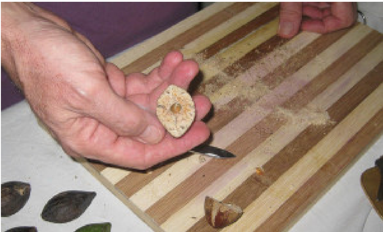
Not much of a kernel