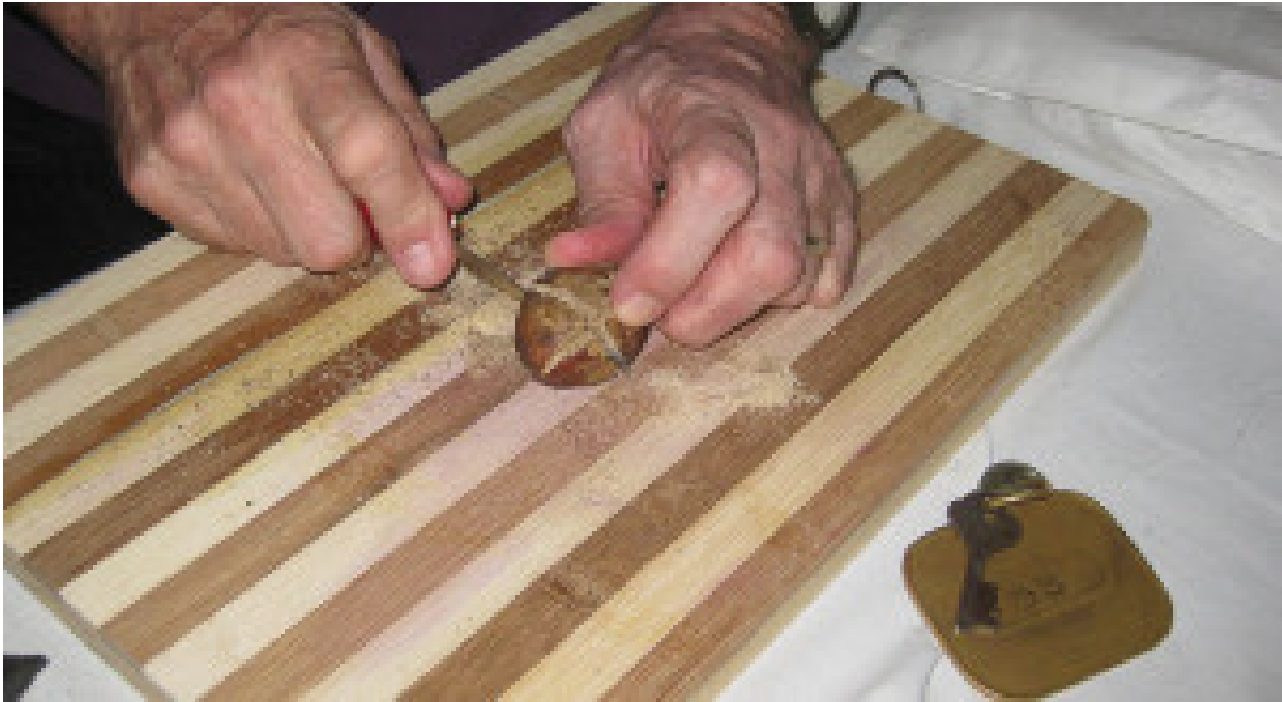
Jim cutting the nut with the saw from a Swiss army knife.