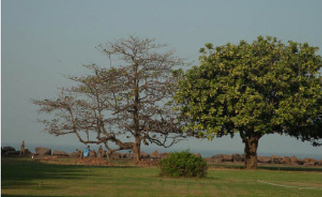
Tropical almond (left) has dropped its leaves. This is the same tree as ne on the ight in the previous picture. (Jan. 3, 2013)