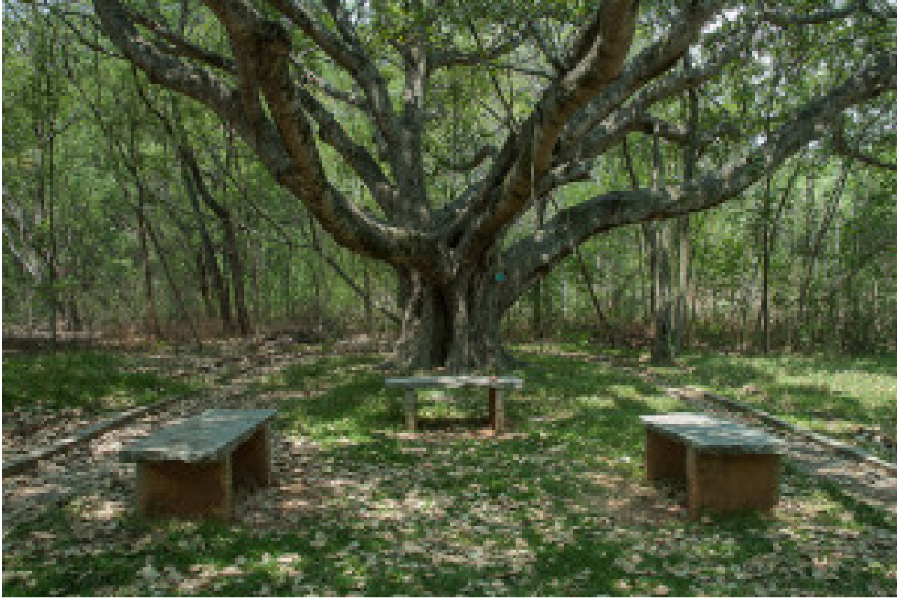
Banyon tree outside the Earth Science Building.