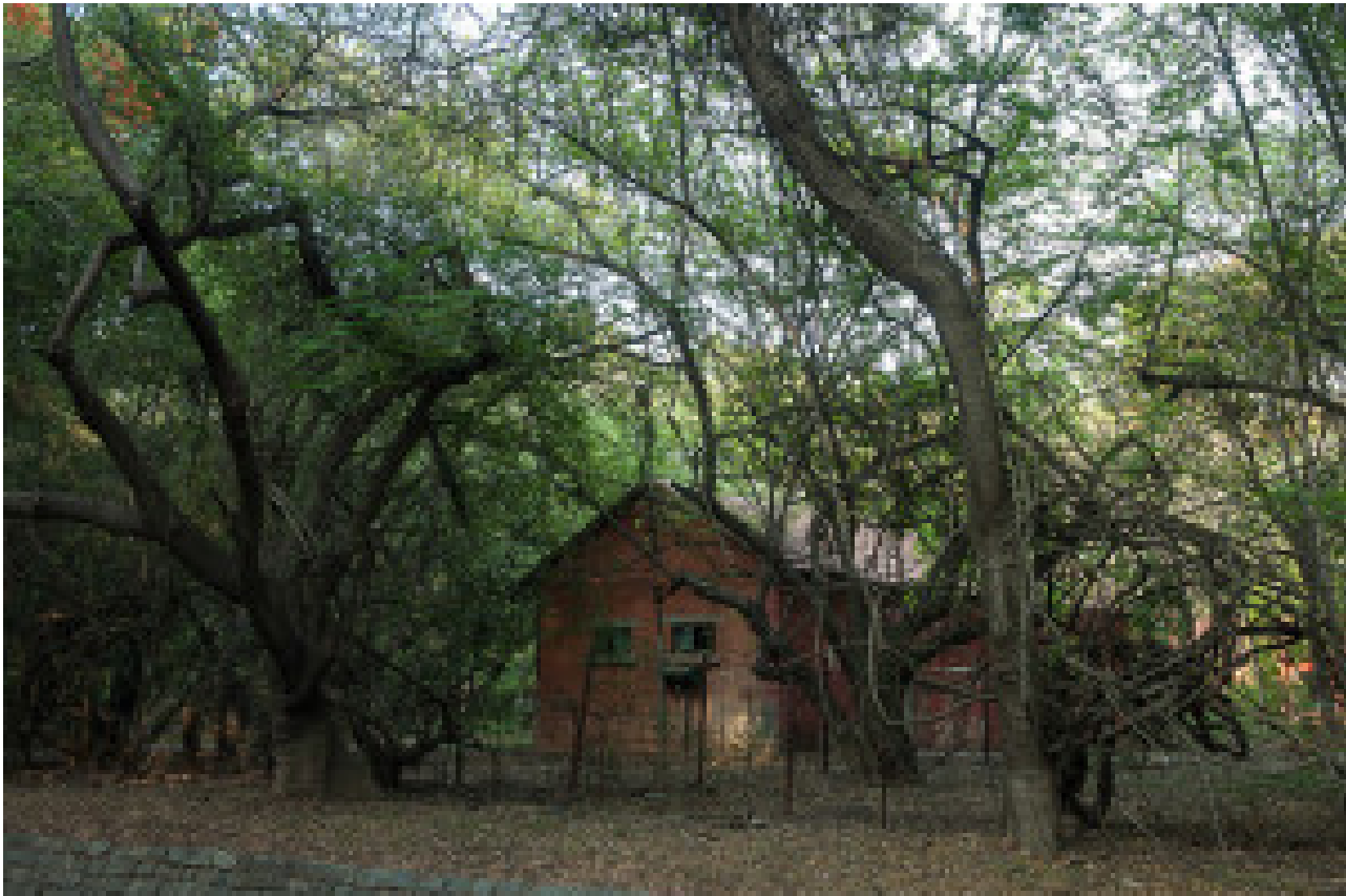
Red building among the trees and vines that cover much of the campus.

We have been here a month now and have come to appreciate the beautiful grounds of the Institute. Most of it is forested and there are some lovely old trees throughout the campus. Roads are named for the trees that line them. Although I have not spent much time learning the trees here, I have taken some pictures around campus that I hope capture the feel of the place. It is different from any other campus I have visited.