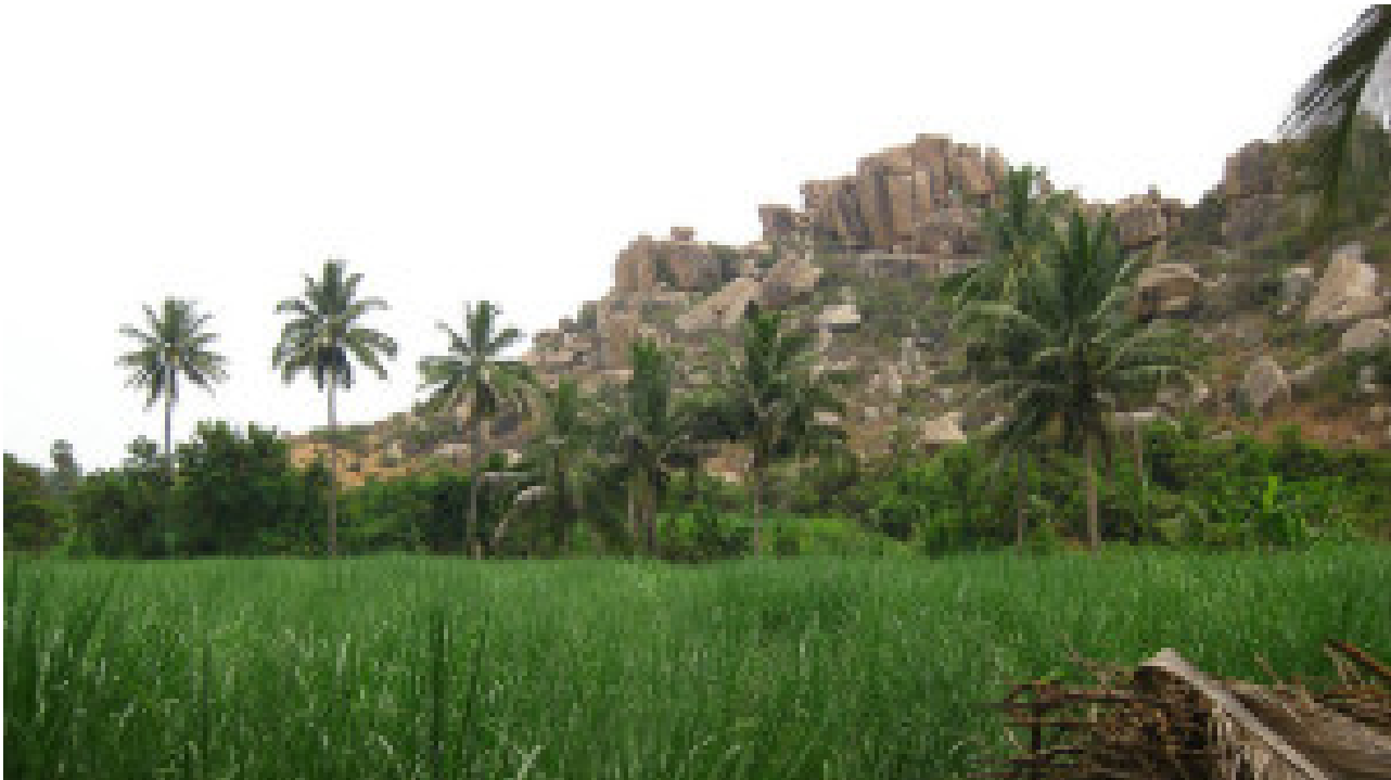
Sugar cane, palm trees and boulders.

Hampi is a small town in the southern part of India, in the state of Karnataka. It is known for its Hindu temples and ruins. Large granitic boulders give it a Joshua Tree kind of feel, with a tropical twist.